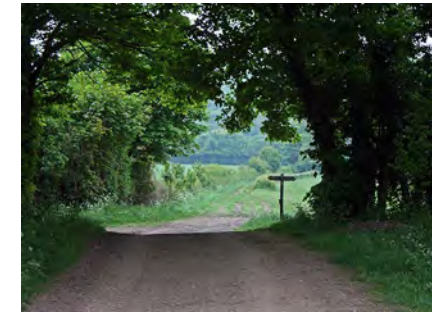
Approaching the Ridgeway National Trail