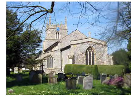
Aston Rowant Church