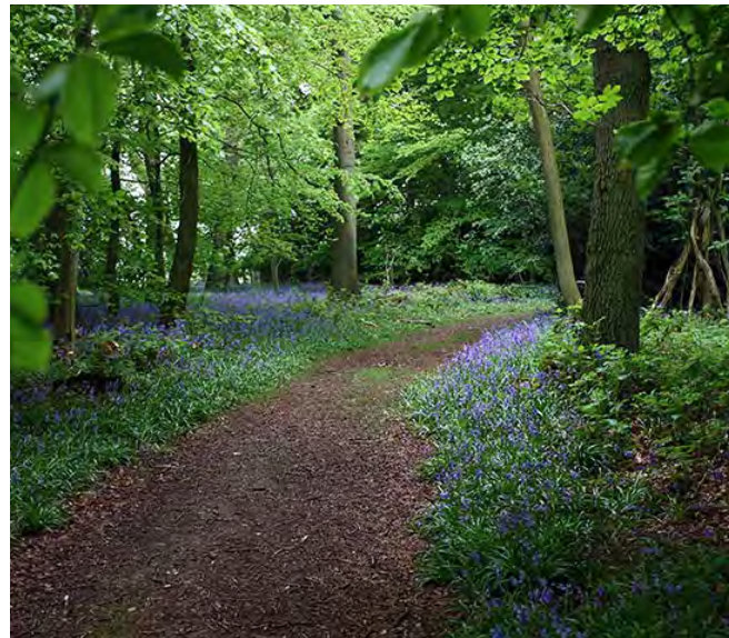
Bluebells in Aston Wood

Cross the A40 to Butts Way. After a short while the B4009 joins from the right. Continue along the pavement until you reach the "Village Only" sign, pointing left to Aston Rowant. Turn left here and you reach the Church where you began.