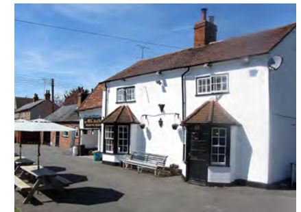
Leathern Bottel, Lewknor