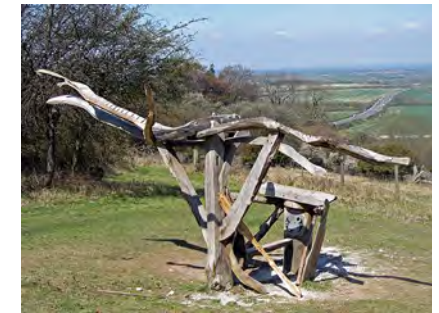
Red Kite Sculpture on Natural England's Talking Trail